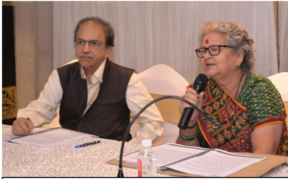
Mayor of KMC addressing the Councillors