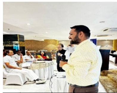
Praja Team addressing the Councillors in Kanpur

An activity was conducted to understand the expectations of the Councillors from the session. A brief pre-session test was also conducted to estimate the awareness and understanding of the elected members on the basics of 74th constitution amendment and sections on UP Municipal Corporation Act.