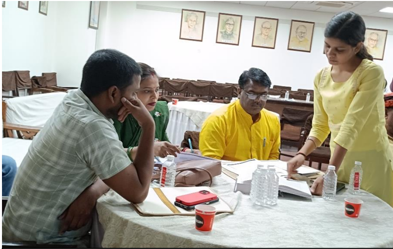
Praja's Fellows engaging with the Councillors