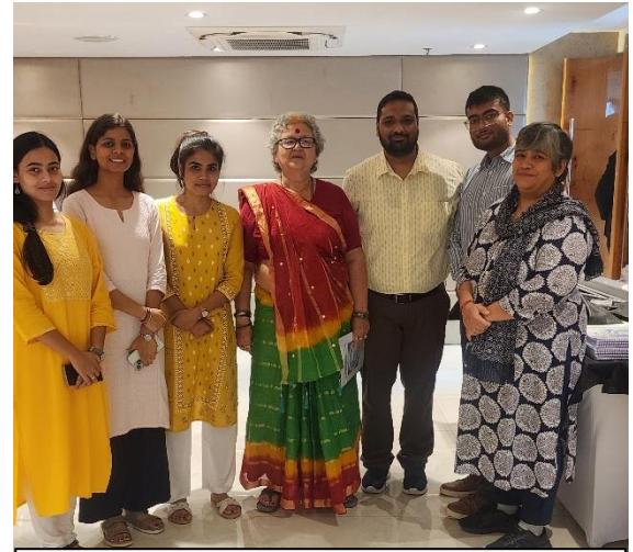
Praja Team with Mayor of KMC