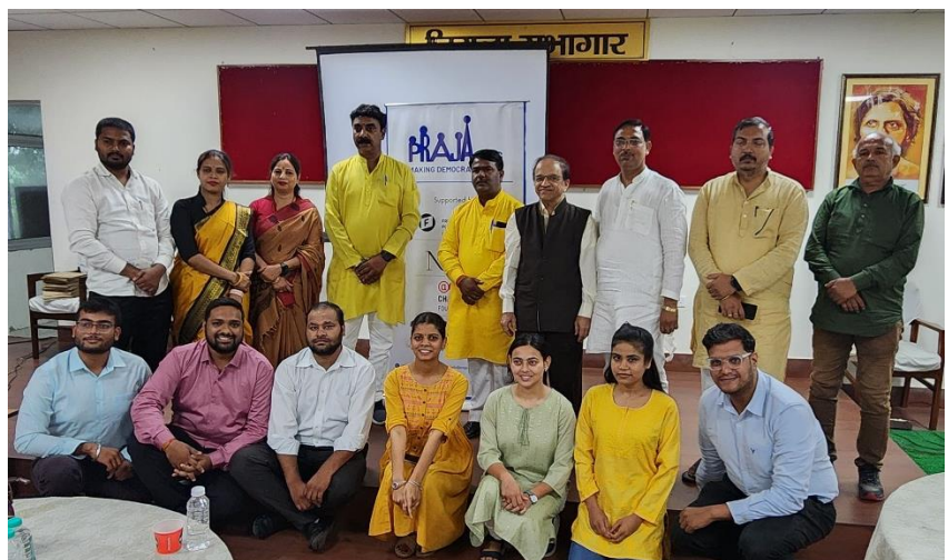
Day 2 of Workshop in Lucknow