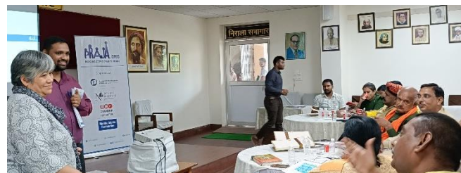
Councillors engaging in active discussion with Praja Team in Lucknow

Furthermore, the councillors actively participated by highlighting their experiences and challenges encountered in the communities, discussing the lessons learned, and offering valuable suggestions to address the identified problems. It was also inferred that the councillors have a collective power as opposed to a singular approach to the issues they face in their respective community.