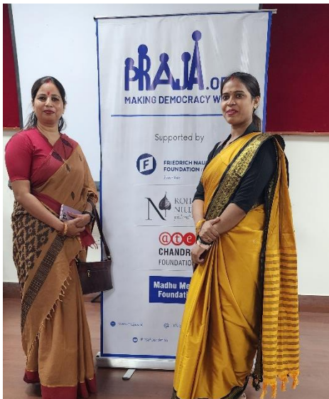
Female Councillors of Lucknow