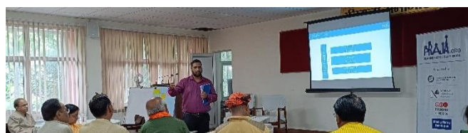
Praja Team addressing the Councillors in Lucknow

An activity was conducted to understand the expectations of the Councillors from the session. A brief pre-session test was also conducted to estimate the awareness and understanding of the elected members on the basics of 74th constitution amendment and sections on UP Municipal Corporation Act.