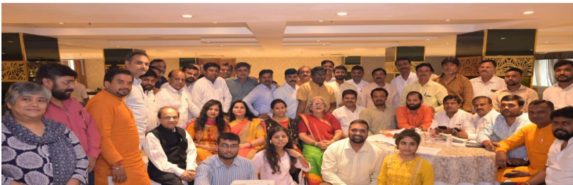
Honourable Mayor of Kanpur Municipal Corporation with Councillors, Praja and Ekjut Kanpuria team

Praja, conducted 2-day capacity building workshops for the Elected Representatives (ERs) of Kanpur and Lucknow Municipal Corporations . The workshops aimed to enhance their understanding of 'Uttar Pradesh Municipal Corporation Act 1959 (UPMCA) and Municipal Finance.' P. C. Pisolkar, a subject expert and former Chief Municipal Auditor of the Brihanmumbai Municipal Corporation (BMC), facilitated the session on 'Municipal Finance' . For these workshops, training modules were specifically designed to simplify the Corporation Act and Finance documents for the Councillors.