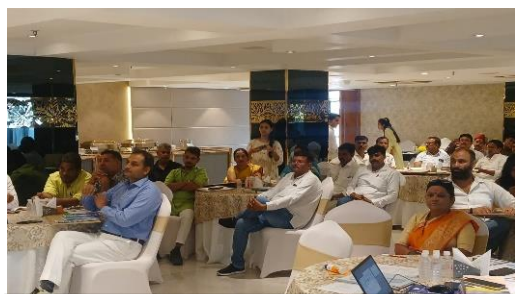
Councillors during the session in Kanpur

This was followed by detailed explanation of the three tiers of government, the legislature and 7 th Schedule of the Constitution which includes the list of subjects under the Union, State & Concurrent List were highlighted. The councillors were introduced to the 74th Constitution Amendment Act, 1992 followed by the 12th Schedule which includes the explanation of 18 functions a city government shall deliver mentioned under Article 243-W.