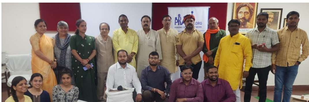
Praja Team with Councillors of Lucknow Municipal Corporation

Apart from the UPMCA and Municipal Finance, the workshop also focused on the three-tier system of Governance, 74 th Constitution Amendment Act, various Committees in a city, roles and responsibilities of a Councillor and deliberation at local level. It also aimed to facilitate networking and collaboration among the councillors.