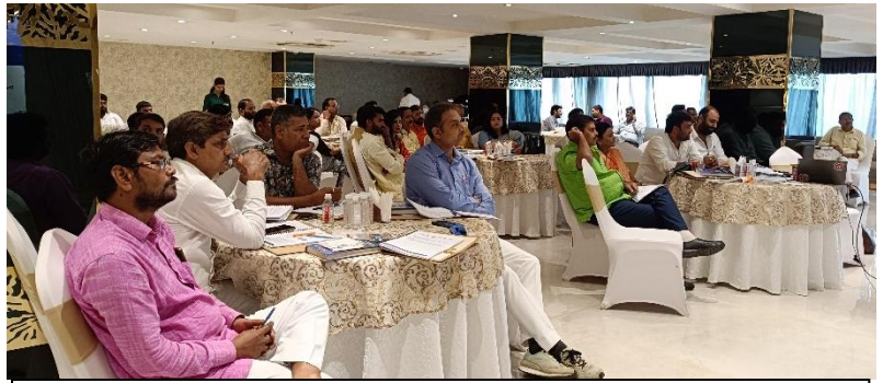
KMC Councillors during the Workshop