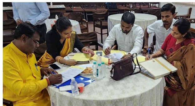
Councillors of Lucknow Municipal Corporation engaged in the workshop activities

The finance session included a comprehensive explanation of the General Principles of Municipal Budgeting. This included discussions on estimated income and expenditure, a comparison between estimated and actual budgets, Budget grants and the importance of conducting reviews to revise the budget in order to ensure a minimum cash balance at the end of the year. A detailed explanation of sources of income and its categories for the corporation was also given. Additionally, detailed explanations were provided regarding the financial calendar and various sections pertaining to finance in the UPMCA.