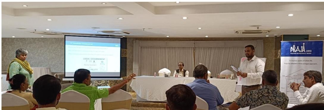
Councillors of Kanpur Municipal Corporation actively involved in the workshop

In another activity, the councillors started reflecting and listed the functions delivered by their respective Municipal Corporation. An extensive discussion took place regarding the various types of committees along with necessity of formulating Ward and Wards Committees. This started with the discussion on tools to enable effective deliberation which highlighted the need for creation of ward committees. It was agreed that Ward Committees would provide a better platform to address local issues effectively.